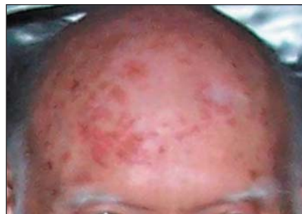
FIGURE 1. Patient's rash was first diagnosed as "actinic keratosis" but, as the pain increased, it became clear that it was shingles in the ophthalmic branch of Cranial V.

The patient was treated with the designated protocol for actinic keratosis—40Hz on one channel and 355 Hz on the second channel using alternating DC subsensory microamperage current at 150 \mu amps—for twenty minutes. This treatment protocol was expected to be helpful for actinic keratosis since 40 Hz has been shown to be effective for reducing inflammation. 2,3 During this portion of the treatment, the patient became restless and complained of increasing pain in the area of the rash. The rash was reassessed and tentatively diagnosed as shingles since the distribution was consistent with the ophthalmic branch of cranial V and was not responding to treatment appropriate for actinic keratosis.